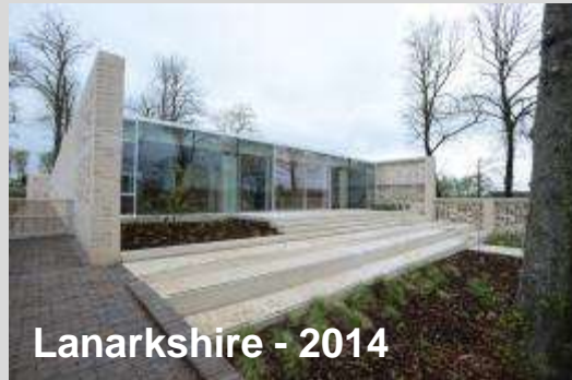
Lanarkshire - 2014