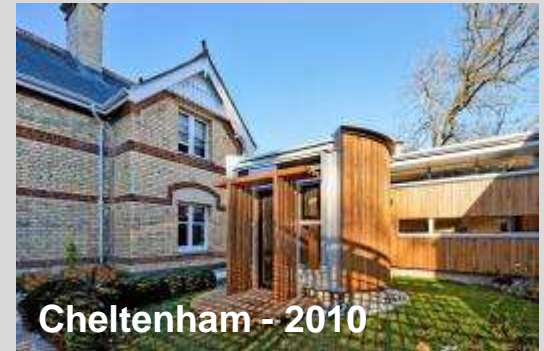
Cheltenham - 2010