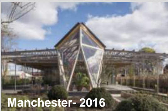
Manchester - 2016