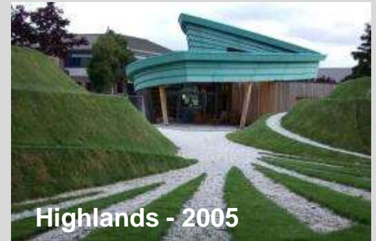
Highlands - 2005