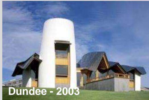
Dundee - 2003