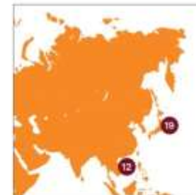
MIDDLE EAST AND ASIA