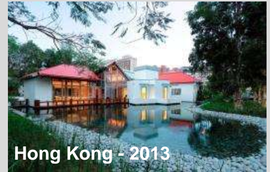
Hong Kong - 2013