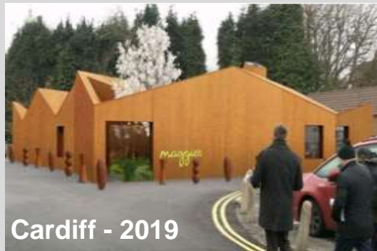
Cardiff - 2019