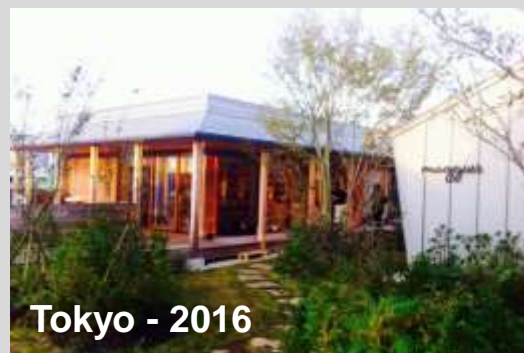
Tokyo - 2016