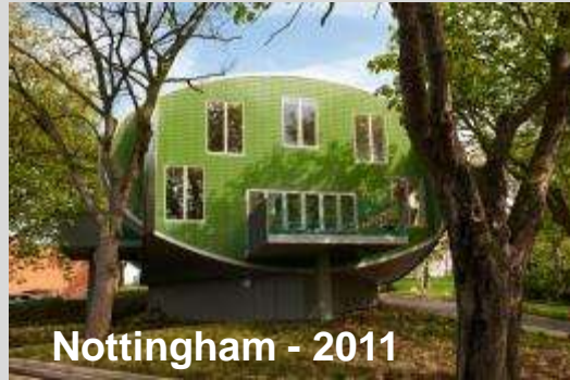
Nottingham - 2011