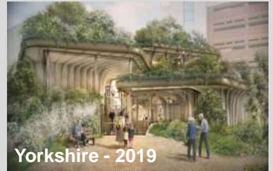
Yorkshire - 2019