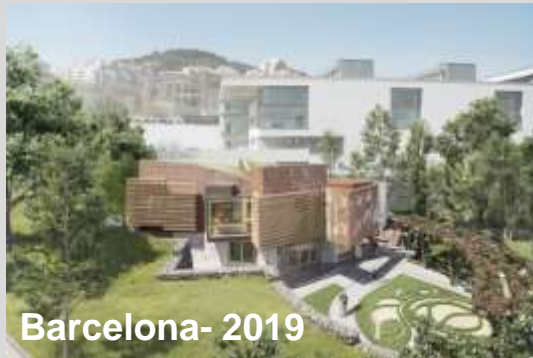
Barcelona - 2019