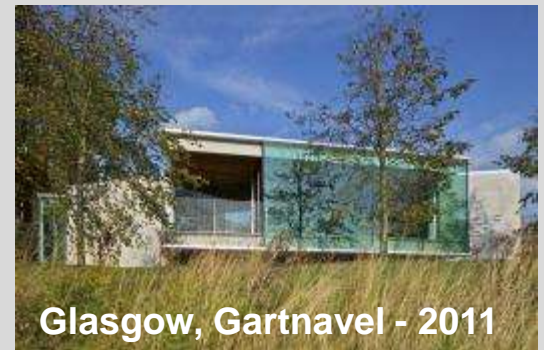
Glasgow, Gartnavel - 2011