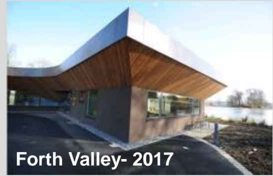
Forth Valley - 2017