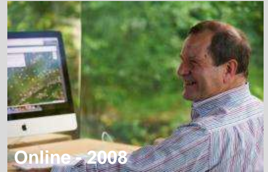
Online - 2008