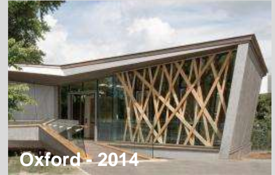
Oxford - 2014