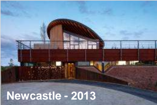
Newcastle - 2013