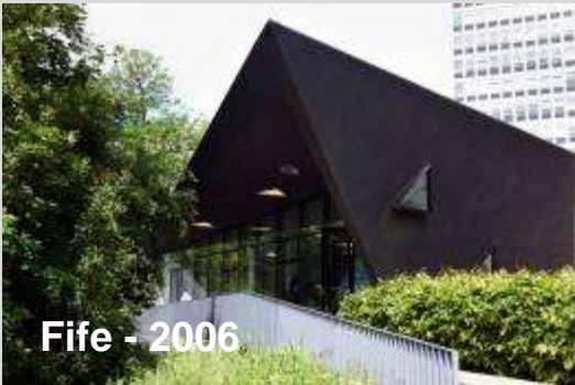
Fife - 2006