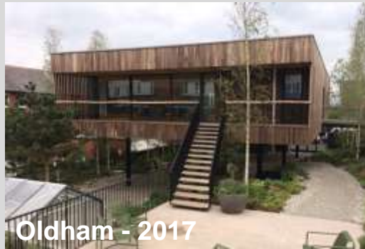
Oldham - 2017