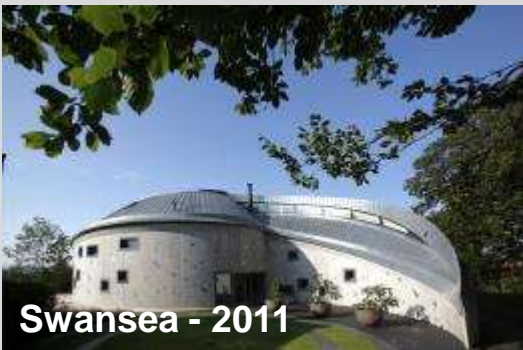
Swansea - 2011