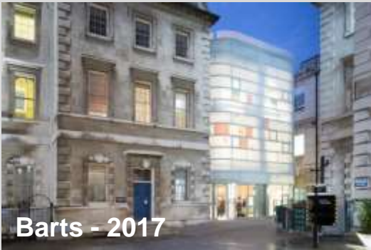
Barts - 2017