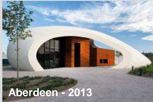
Aberdeen - 2013