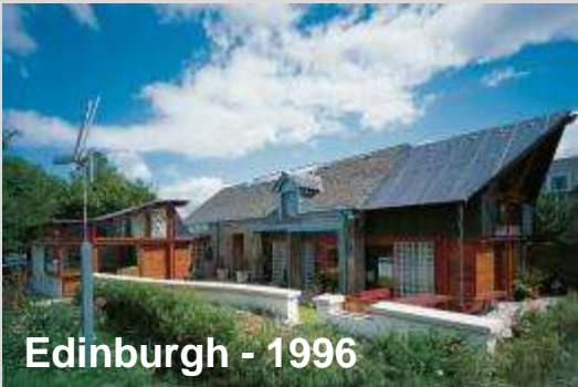
Edinburgh - 1996