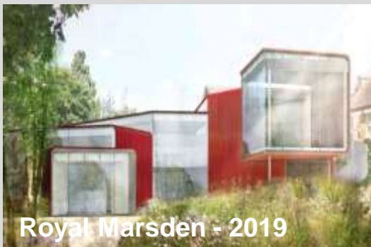
Royal Marsden - 2019