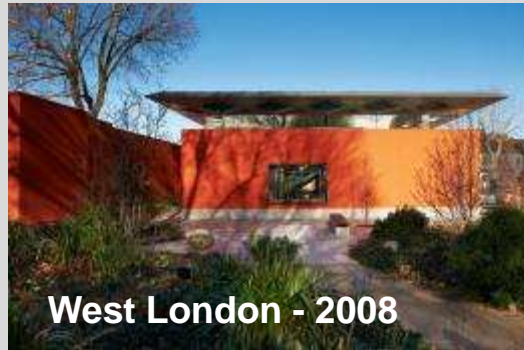
West London - 2008