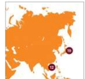
MIDDLE EAST AND ASIA