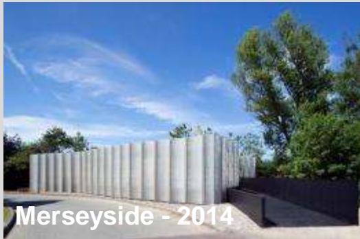
Merseyside - 2014